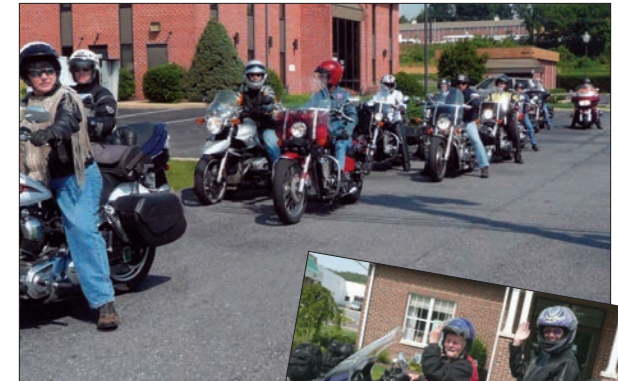
Heading out for a "Second Sunday Ride"