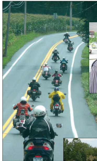
Enjoying comraderie even in the rain