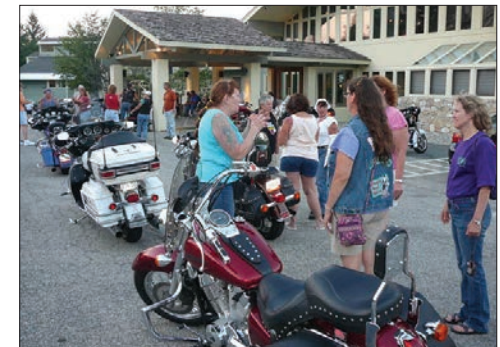
Mingling at a WOW® national rally