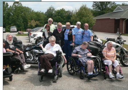
Meeting & greeting at a charity ride