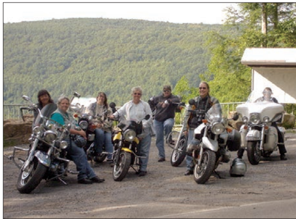
Stopped at a scenic overlook on a weekend getaway to Western PA

Presenting our annual Ride For HOPE proceeds to a worthy cause. Each t-shirt color represents a different year of giving.