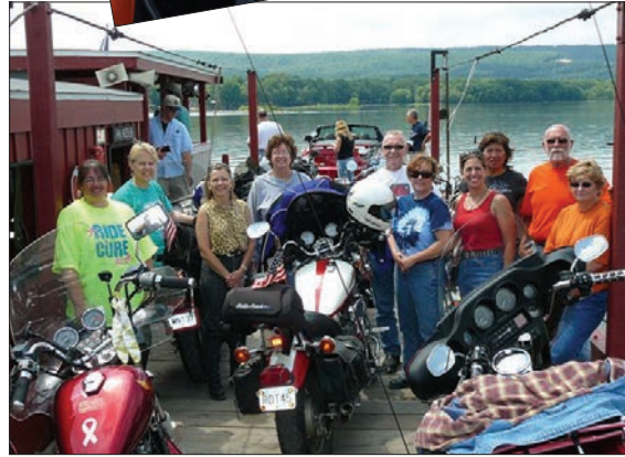
Crossing the Susquehanna River on the Millersburg Ferry