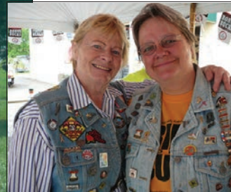
Mother and daughter, both riding with the chapter!