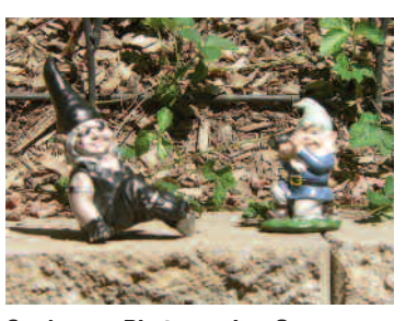
Sue's new Photographer Gnome had to get a shot of Nat's Biker Girl Gnome.