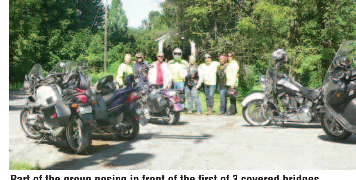
Part of the group posing in front of the first of 3 covered bridges.

Thanks to Dawn for planning a neat ride. Great fun.