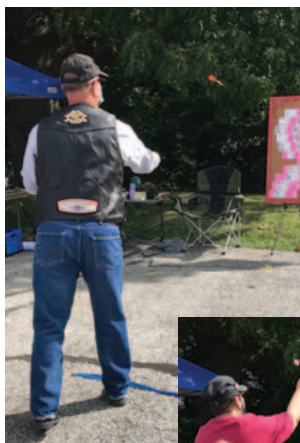
At right, Paws gives it a shot.