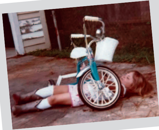
Twin Rose in the making — getting her bike ready for winter.

Find this events calendar at www.twinroseladyriders.com