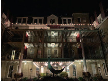
Crescent Hotel in Eureka Springs, AR

I had the opportunity to ride to Eureka Springs, Arkansas with two friends. The plan was to be there on day three and spend a few days riding the Ozarks. Everything was going well until our third day of travel. We stopped for a quick gas break and when I came back out to start my bike, it just made a whirring sound. Why would this surprise me? With the way my riding season has been going, I probably should have expected it, but I try to be optimistic.