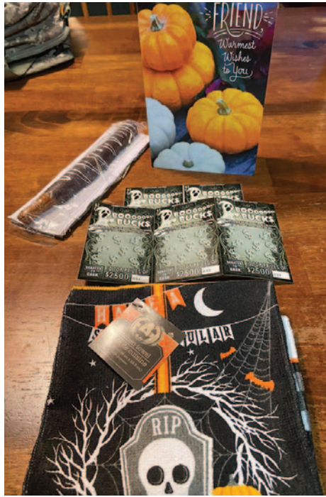
Crystal was spoiled with goodies again!