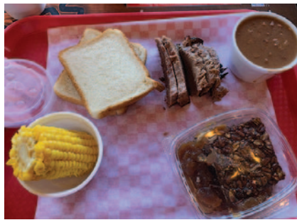
Breakfast in TX

The next day I met up with my travel companions in Eureka Springs. We spent two days riding the Ozarks and eating some