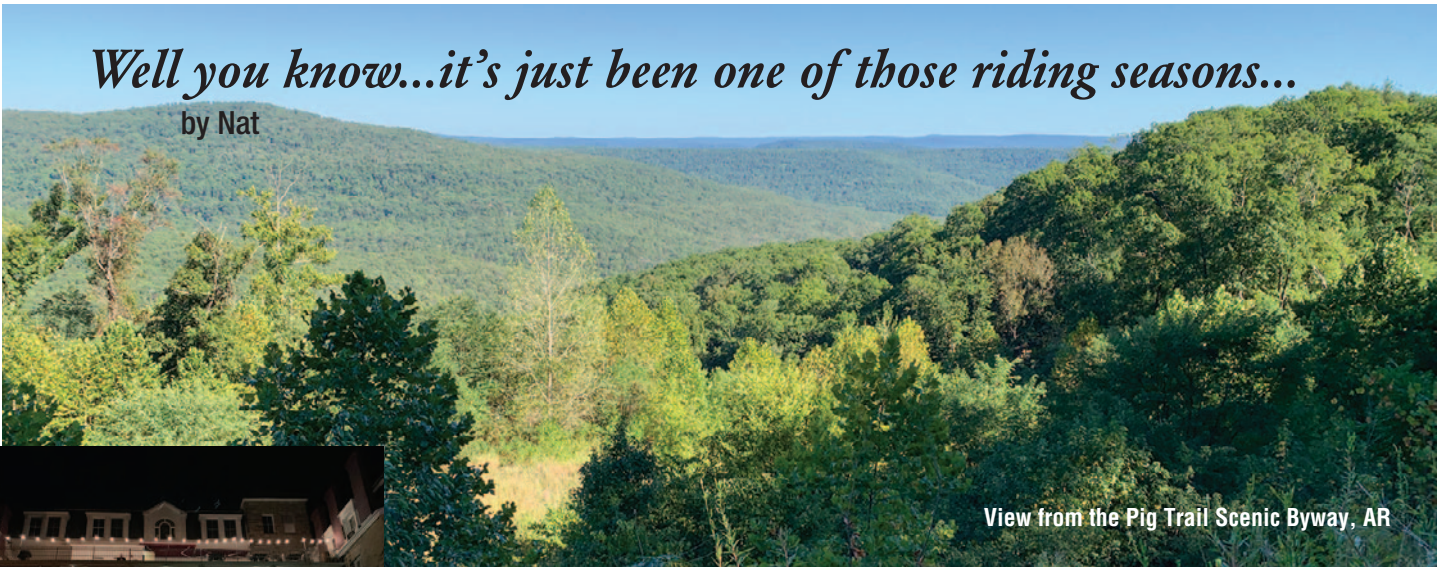
View from the Pig Trail Scenic Byway, AR