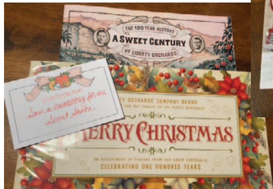
Paws' sweet tooth says ThankYou.