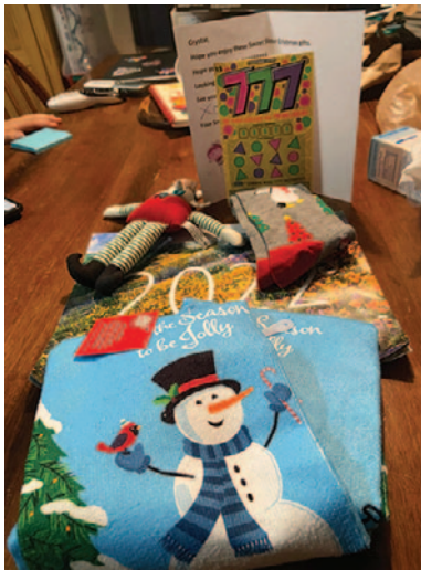
Crystal was spoiled with goodies again!