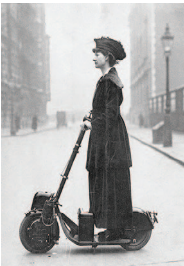
International Female Ride Day circa 1890

Let's hope for some decent weather and meet up with other chapters for lunch. Dawn H will be FOO and head to Schell's in Temple, PA, north of Reading. Check the Calendar page and Let's Ride.