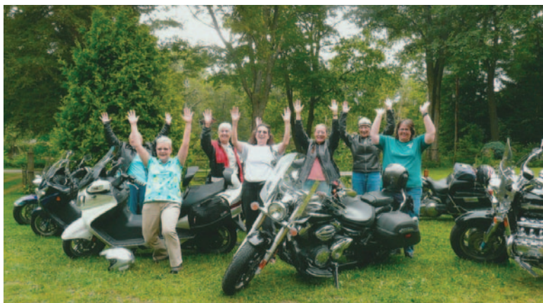
Carrying on at Bernie's Weekend in 2008