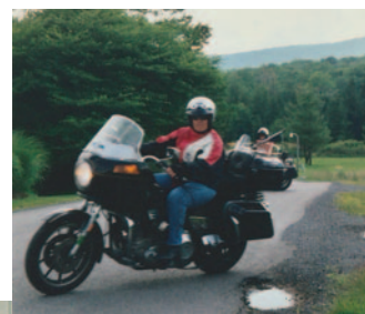
At our 2004 WOW WV Ride-In cabin; and below, in our chapter group pic